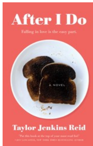
After I Do

A breathtaking novel about modern marriage, the depth of family ties, and forging your own path to happily ever after.