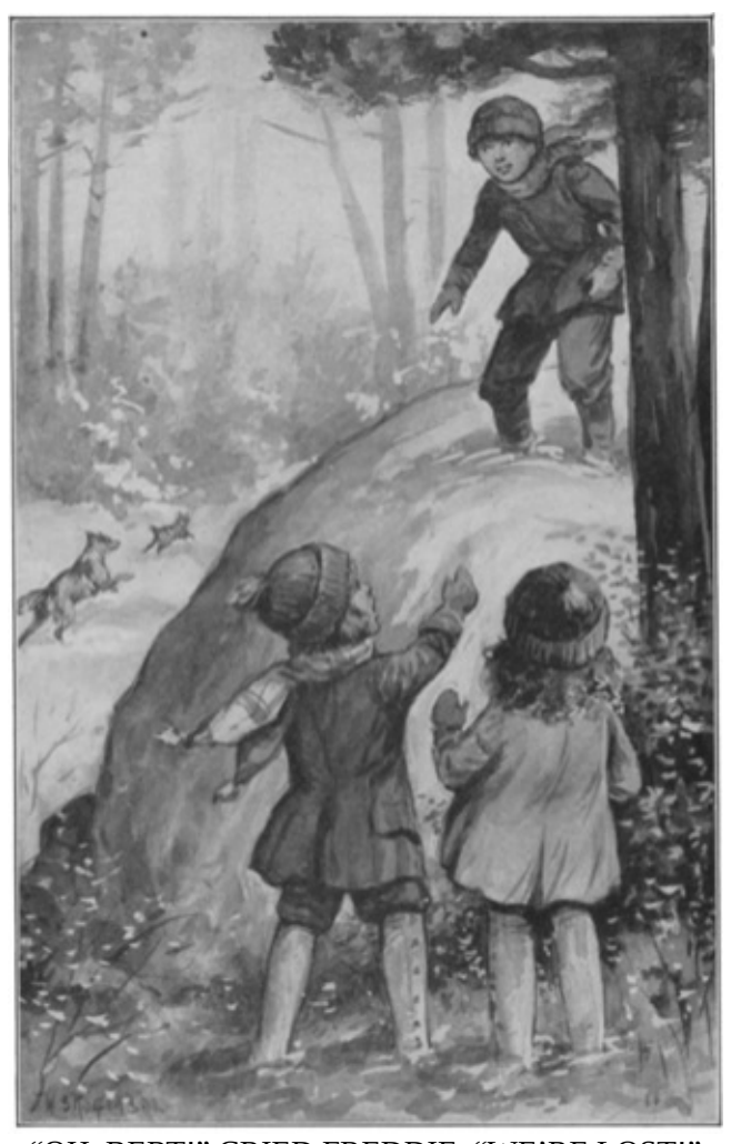
"OH, BERT!" CRIED FREDDIE, "WE'RE LOST!"

"Oh! A wildcat!" cried Bert, as, a moment later, there sprang out at him the same animal, or one very like it, that he had snowballed a little while before. Probably it was another lynx, but Bert did not stop to think of this.