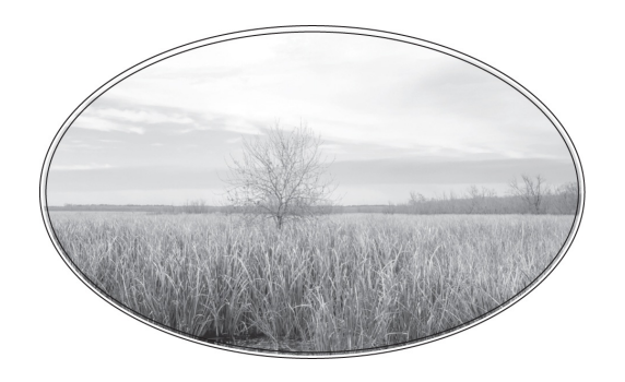
To damage the earth is to damage your children. —WENDELL BERRY, FARMER AND POET